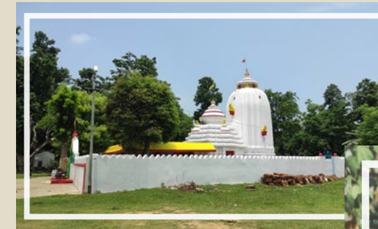
Swapneswar Temple, your immediate neighbour